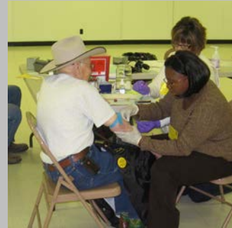
Screening of former worker

blood test, she found out that she had Stage 2 colon cancer and had surgery to remove the tumor. She claims that the FWP medical screening saved her life by providing the early detection of her cancer.